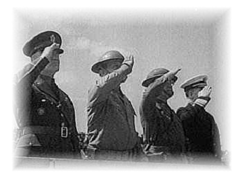
Serv-A Serving Jewish Servicemen and Women Chairman: